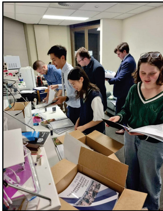
Everyone working together to fix the guide!