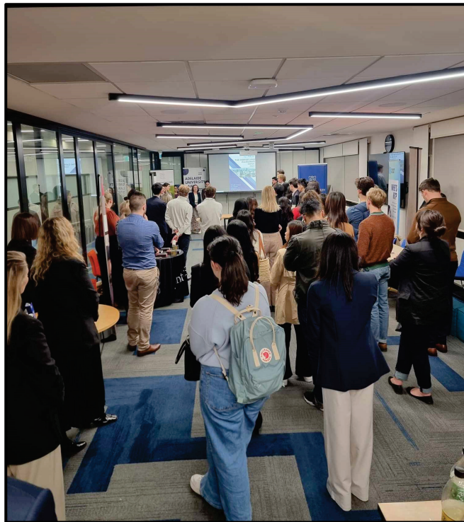
Firm introductions at the start of the launch!